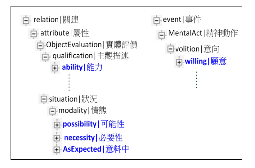
Figure 2: Modal Categories in E-HowNet Sense Representation System